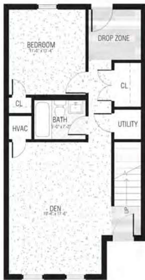
UNIT 6 ENTRY LEVEL