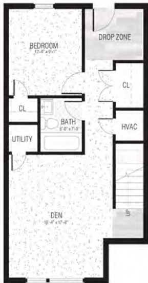
UNIT 14 LOWER LEVEL